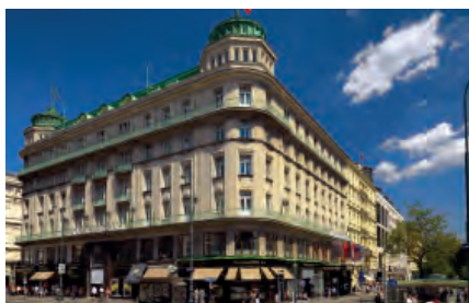
Hotel Bristol, Vienna

Hotel Kaiserhof Vienna is situated a few steps away from Naschmarkt and the State Opera House. The hotel is family-owned and enjoys 74 comfortable rooms and suites.