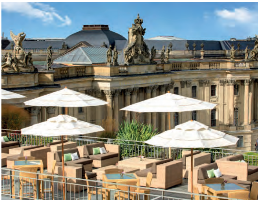
Hotel de Rome, Berlin, rooftop terrace

Myers Hotel Berlin is located a short walk from Alexanderplatz and Museum Island in a quiet area. The hotel was built in the late 19th century and maintains a classical style throughout with parquet flooring and historical furniture. There is a small spa, breakfast area and lovely garden to relax in after a day of sight-seeing.