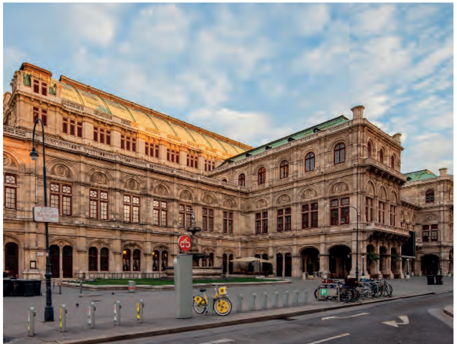
Vienna Opera House