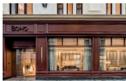
Hotel BoHo, Prague