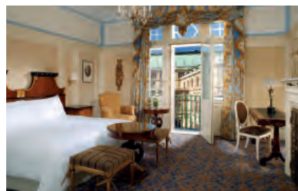
Deluxe room, Hotel Bristol, Vienna