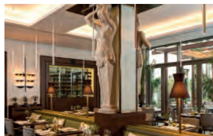
La Banca restaurant, Hotel de Rome, Berlin