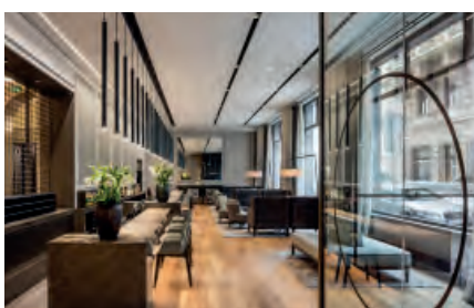
Hotel BoHo, Prague