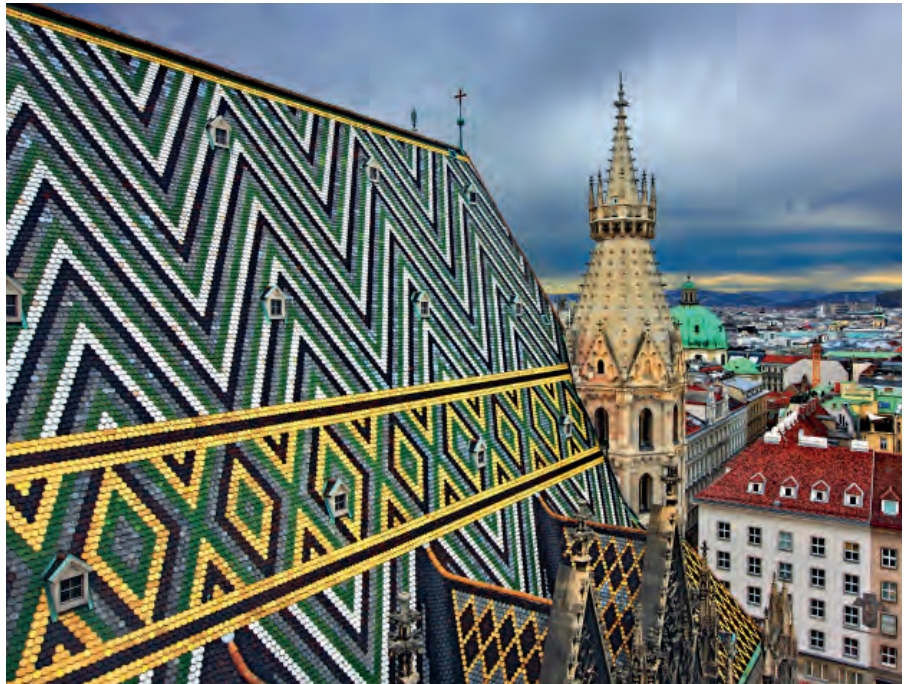
Vienna, St Stephan's Cathedral

At the end of the tour you can fly back to the UK or you can leave Vienna in the evening on the overnight sleeper train (2 berth cabin included) to Cologne. Arriving in Cologne in the morning, you transfer to the Brussels train and then on to London by Eurostar.